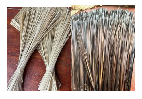
Fig.1 Characteristics of bamboo stripes: (left) not exposed to smoke and (right) that have been smoked.