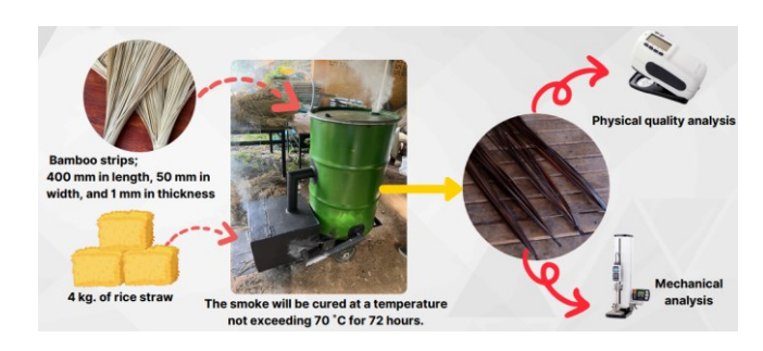
Fig. 5 Process diagram

In this study (Fig. 5), bamboo strips measuring 400 mm in length, 50 mm in width, and 1 mm in thickness (obtained from the weaving group) will be utilized. In the section concerning smoke generated from 4 kg. of rice straw, the smoke will be cured at a temperature not exceeding 70 °C for 72 hours. This is done to compare the physical and mechanical properties of the bamboo strips used in the smoke-curing stove developed against the original smoke-curing stove of the local community.