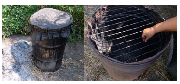
Fig. 2 Traditional smoke oven of the villagers.

materials. These advancements aim to enhance the aesthetic appeal of the new weaving designs and increase the value of each woven piece. Additionally, it offers an alternative for both weaving groups and individuals to acquire knowledge, improve their livelihoods, and develop materials used in weaving crafts while promoting beauty and reducing the use of synthetic chemicals. This approach not only helps reduce production costs but also contributes to environmental sustainability.