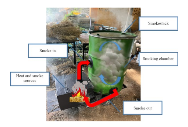
Fig. 4 Working process of smoked kiln

leftovers collected from the local population as fuel. The smoke-drying kiln's operation begins with the burning of rice straw fuel, which is the principal heat source for the smoke-curing process. When enough heat is created, hot air and smoke pass through the heat exchange mechanism, as seen in Fig.4. As hot air travels through the heat exchange device, it transmits heat to the surrounding environment, raising the interior temperature of the smoke-drying chamber. The heated air and smoke then move upward and exit out the chimney. The chimney is then closed, allowing air and smoke to circulate throughout the kiln. A part of the descending air enters the heat exchange device and undergoes heat exchange before being discharged into the incinerator. This technique will continue till the smoke-curing process for bamboo stripes is complete.